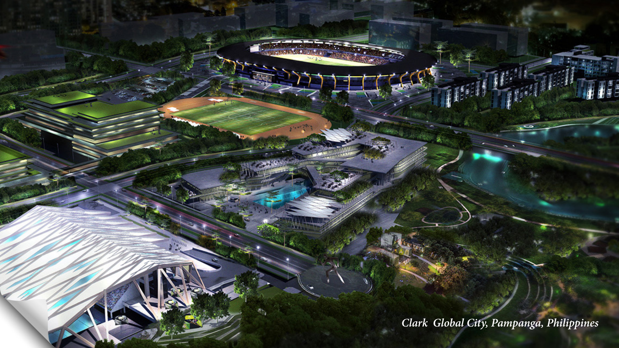
Clark Global City, Pampanga, Philippines