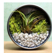
August 2 Terrarium