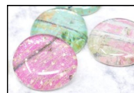
July 5 Fridge Magnet